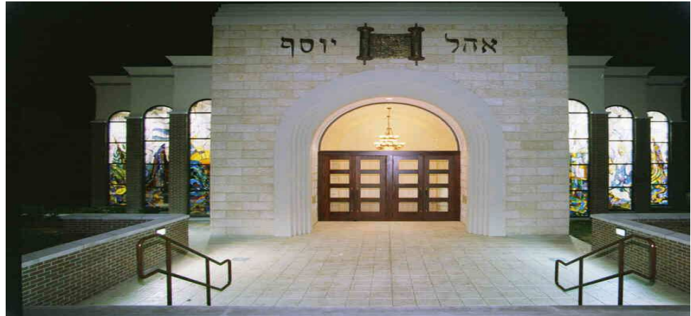
85 West Mount Pleasant Avenue, Livingston, New Jersey 07039